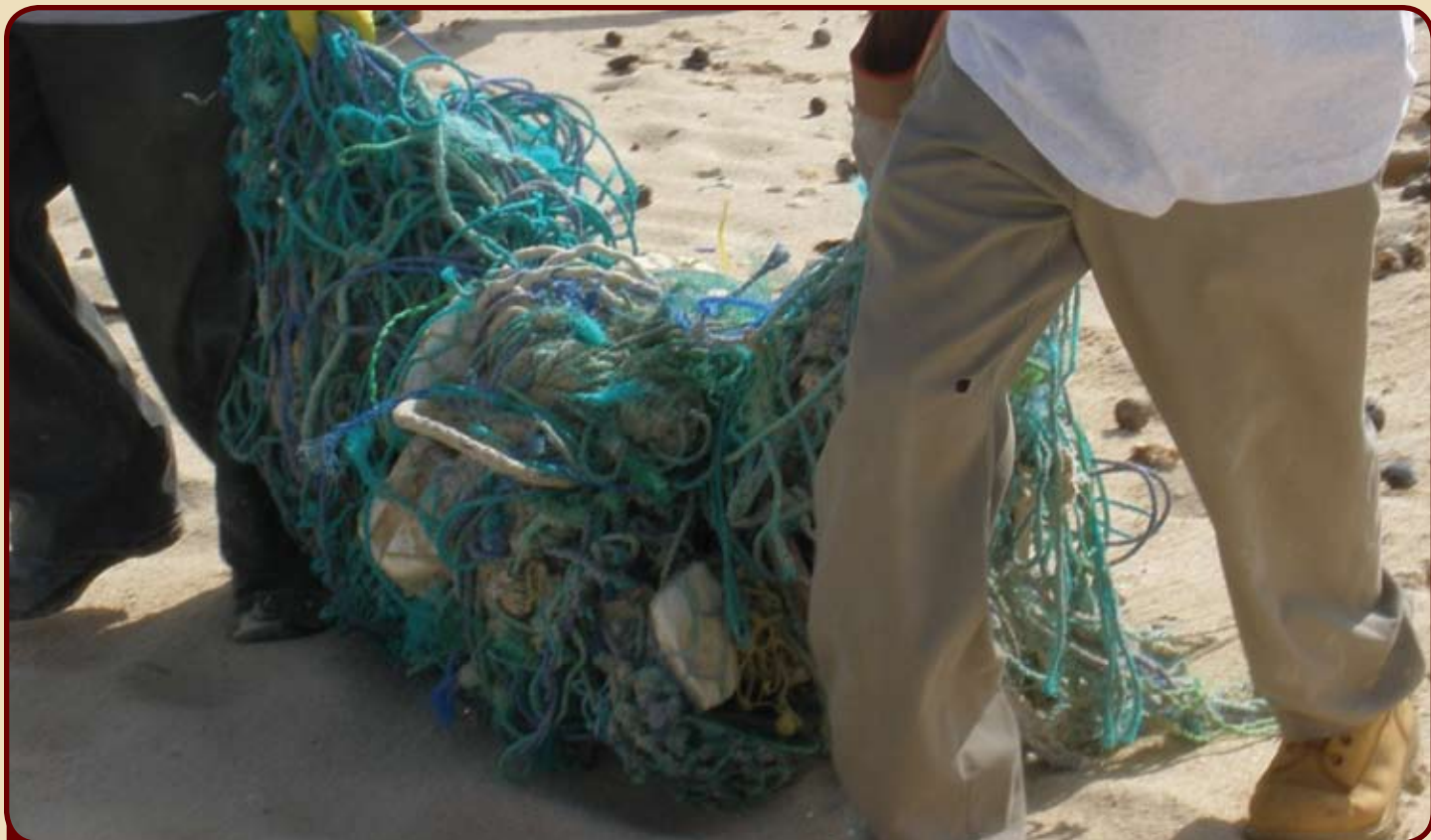
Volunteers Removing Refuse from Long Beach

On International Coastal Cleanup Day, September 19, 2009, the EPD will host its annual beach cleanup at Morgan Lewis Beach, St. Andrew. Anyone interested in participating should join us and help keep our island clean and safe for future generations. Groups interested in adopting and monitoring other beaches should contact the EPD for further information.